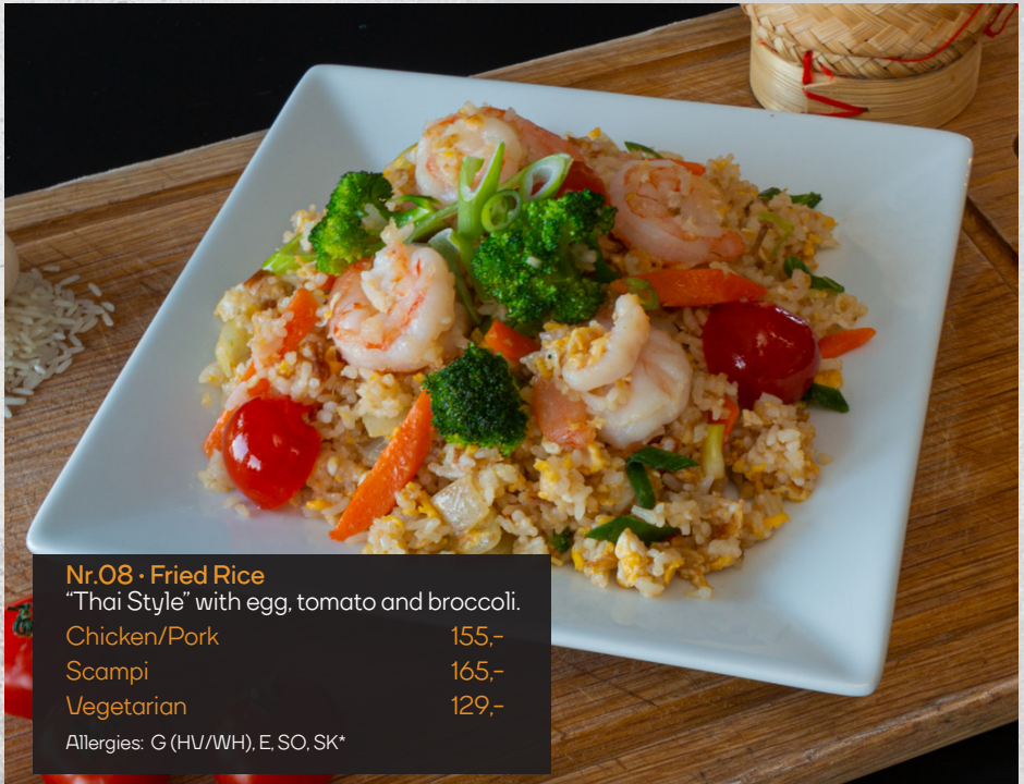
Nr.08 · Fried Rice "Thai Style" with egg, tomato and broccoli. Chicken/Pork 155,- Scampi 165,- Vegetarian 129,- Allergies: G (HV/WH), E, SO, SK*